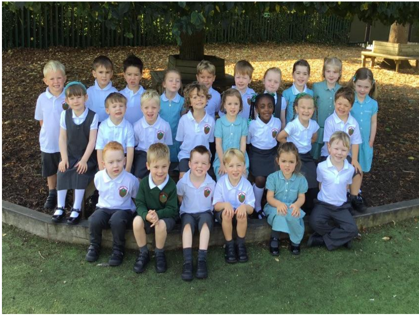
Don't they look smart in their uniforms!