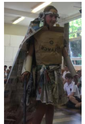
Recycled Fashion Show 2017

On the final Friday of last half term our Year 5 and 6 children became fashion designers and models for the day. They used waste packaging, cartons, boxes etc. brought in from home, and were given the task of designing an outfit using nothing but these materials, a roll of sellotape and 10 staples! They worked in small groups and at the end of the day they put on their very own fashion show for the rest of KS2 - P.E mats doubled up as a catwalk and our ICT suite made a perfect dressing room. It was a fantastic day, the outfits were amazing and we certainly have some future models!